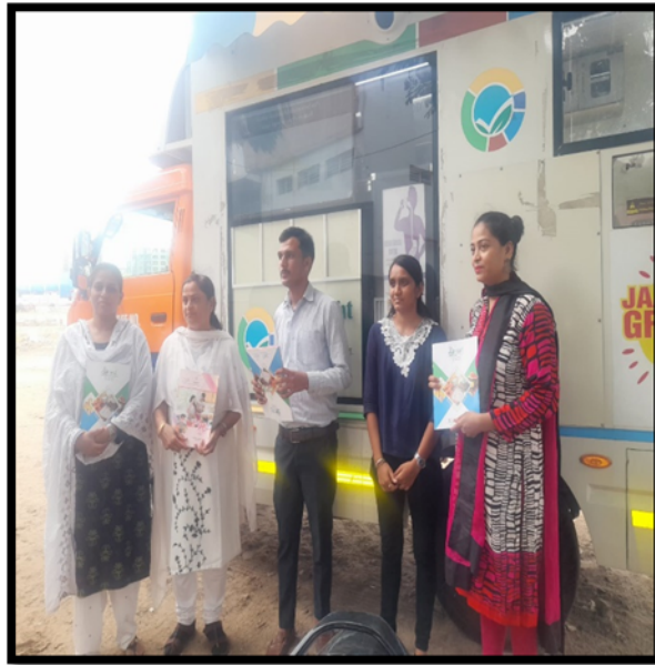
Demonstration on Food Safety on Wheels (FSWs)